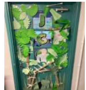
1 st Place JGO