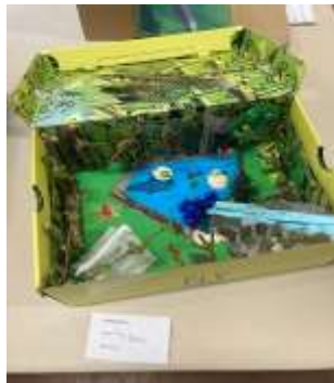
2 nd Place Tehya Benham HCA