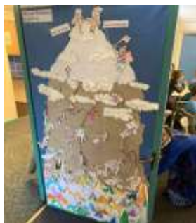
1 st Place SAB