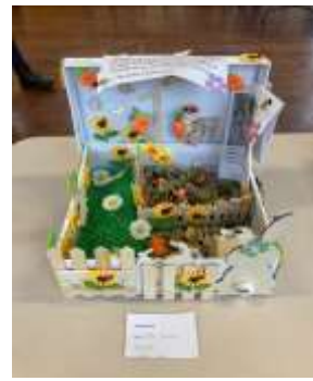
2 nd Place Lottie Tanton LLO