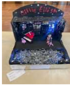
1 st Place Rosie Bowden-Broadley SAB