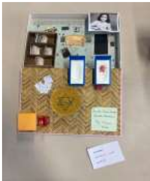
3 rd Place Marcie Wines RPR