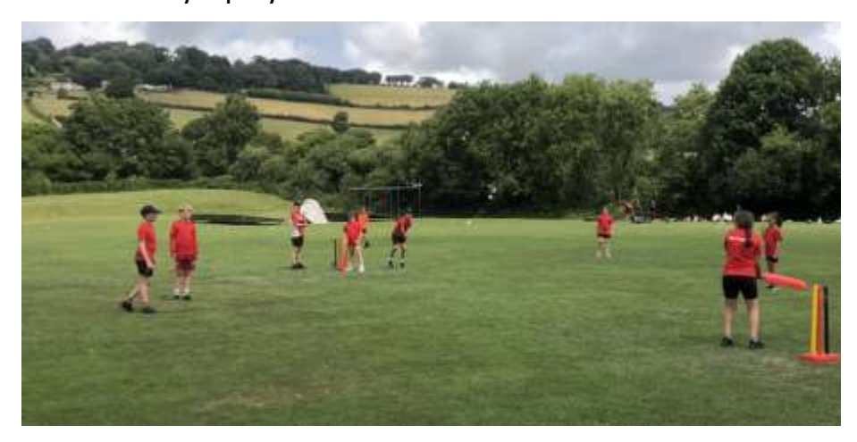
Rising Stars 2023 – Day 3 - Our Yr 6 pupils had a great day out as part of the Rising Stars programme at Skern Lodge. They challenged themselves and worked in teams with children from other Barnstaple primary schools.